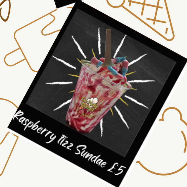
Raspberry Fizz Sundae £5