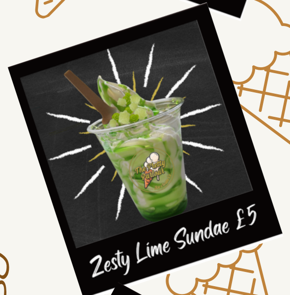
Zesty Lime Sundae £5