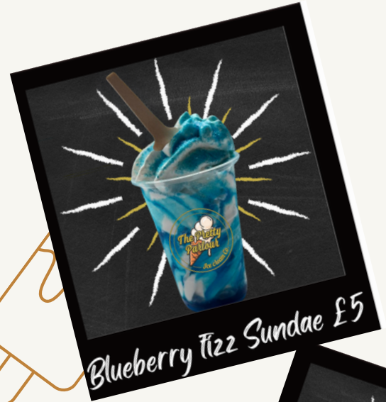
Blueberry Fizz Sundae £5